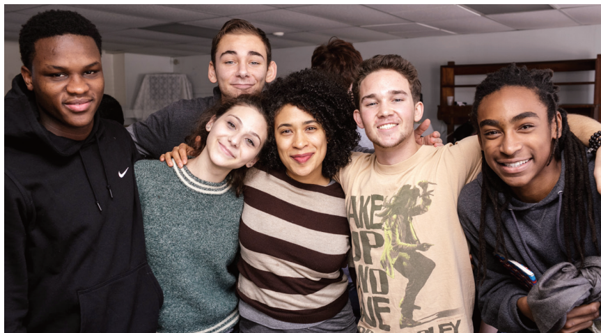
It's not easy to say goodbye. Above, staff and teens gather for hugs and photos at the close of a retreat, North Andover, MA, January 2016. For some participants, the retreat is a once-in-a-