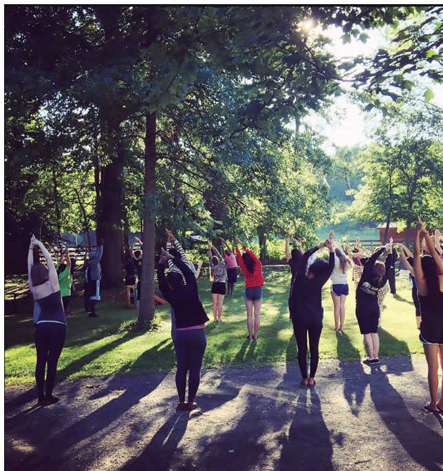
Moving meditation is also key to the retreat experience. Below, morning yoga exercises before breakfast. Summer 2015, Old Chatham, NY.

day unfolds: breakfast in silence, community chores, free time, sitting meditation, walking meditation, small group meetings, lunch, more free time, workshops, yoga, dinner, kindness meditation, wisdom talks, more small group meetings, meditation, and lights out at 11. On the first night, the teens commit to holding to five precepts during the retreat: to protect life, to speak truthfully and kindly, to take only what is freely offered, to abstain from drugs and alcohol, and to remain celibate.